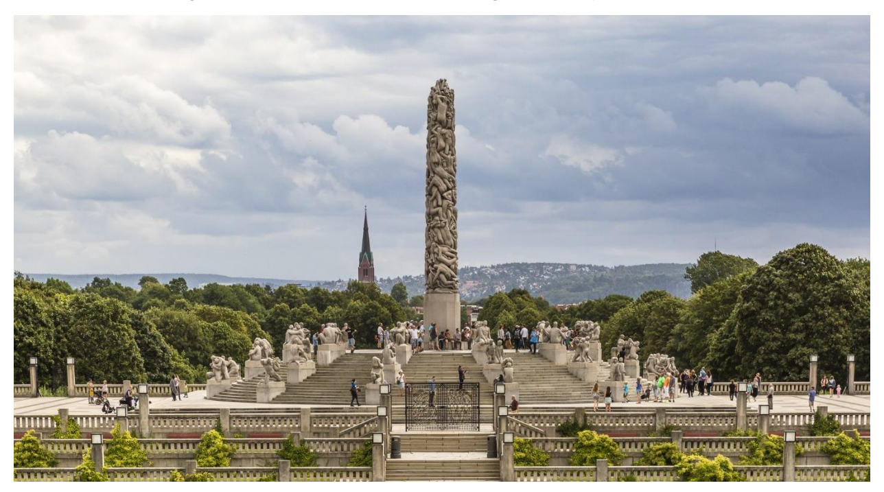
Monday, August 18

Morning – Visit the Norwegian Folk Museum – This is a large outdoor museum that has buildings from many different parts of Norway and many different time periods.