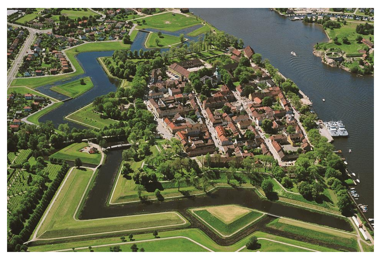
Wednesday, August 20 Morning – Walking tour of downtown Oslo

Noon – Attend worship at the Oslo Cathedral (Domkirken) – The main church in Oslo has a short worship service at noon on Wednesdays, followed by a light luncheon in the church basement, which we will attend.