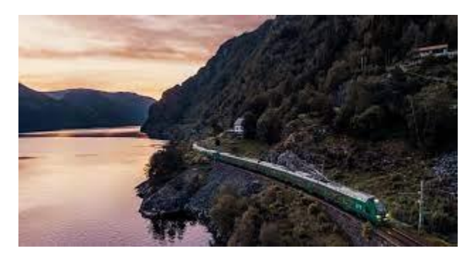
Friday, August 22

We take the train going across southern Norway from east to west, from Oslo to Bergen. Enjoy the spectacular view as the train travels through the Hallingdal valley, across the mountain and the Hardanger plateau, and down alongside the fjord towards Bergen.