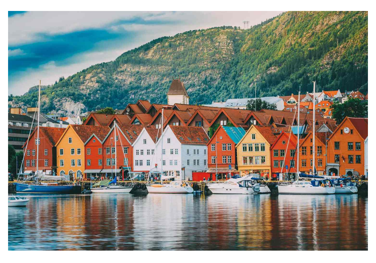
Saturday, August 23 We leave Bergen, traveling by bus to Voss and then by train to Myrdal. At Myrdal we get on the Flåm train (Flåmbana), a very popular train ride down the mountain to Flåm.