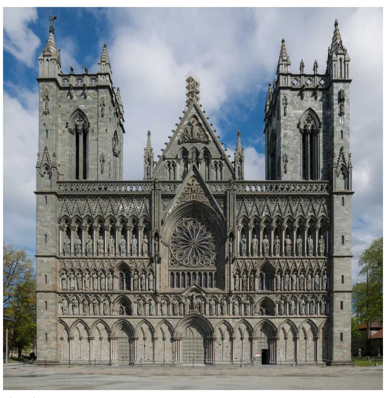
Thursday, August 28 We take a bus tour to Stiklestad, the place where Saint Olaf was killed. The Stiklestad Church is a stone church built in 1180. We will visit the Stiklestad National Cultural Center.