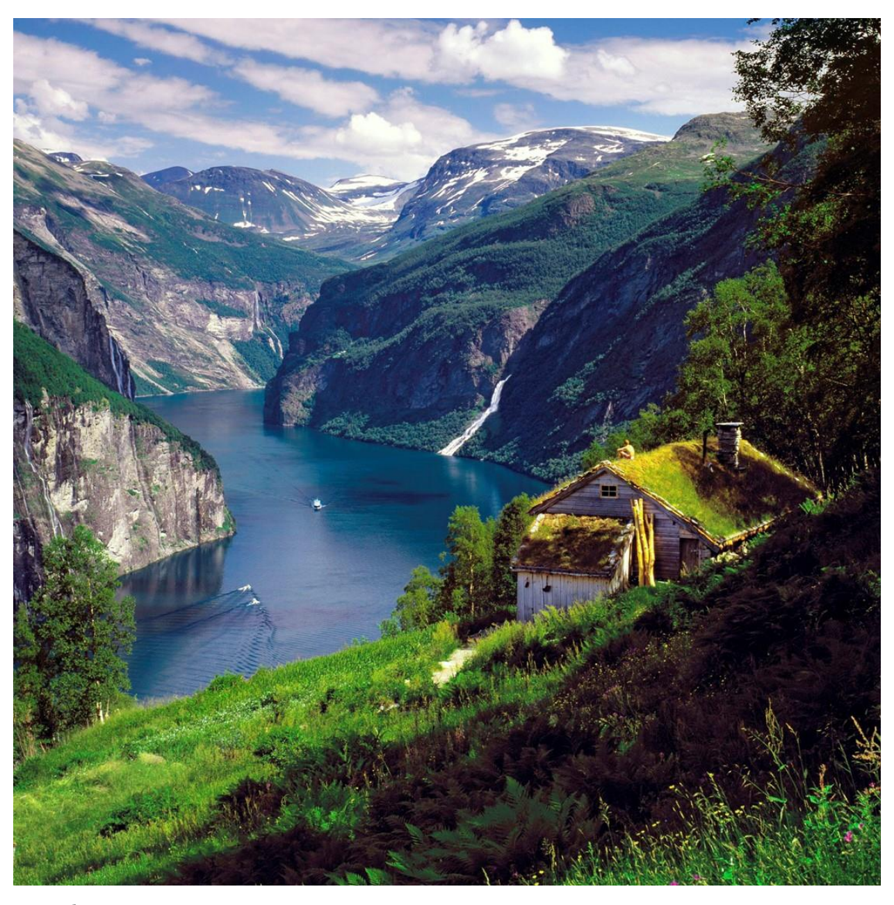
Tuesday, August 26 We continue our tour through "Fjord Country" and will drive on the famous Trollstigen (a mountain pass that twists through eleven hairpin bends up the steep mountain sides in Romsdalen valley).