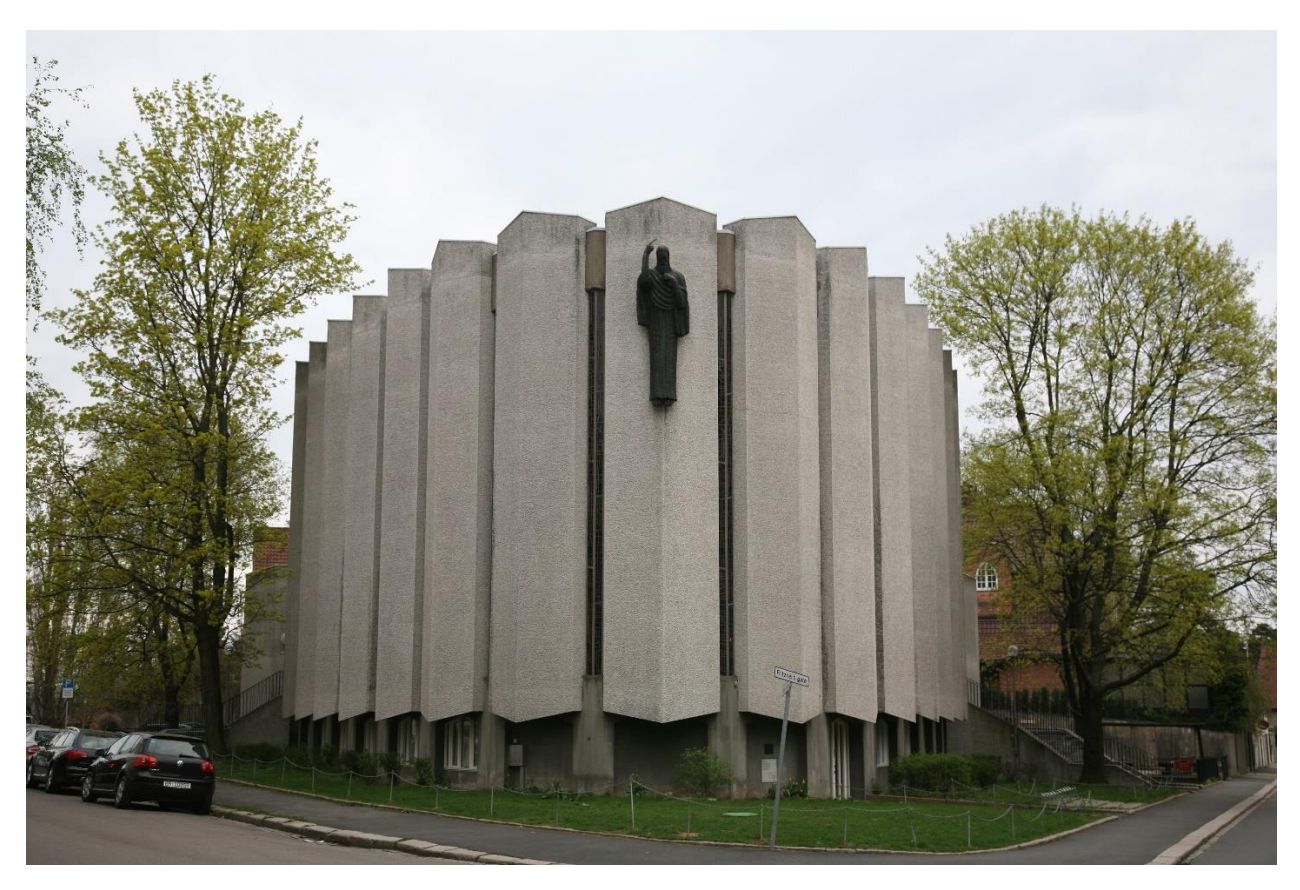
Afternoon – Visit Frogner Park, which is the site of the Vigeland Sculpture Park.