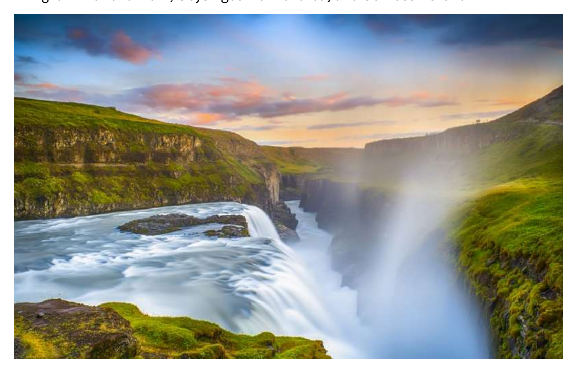
Saturday, August 30

We will take the "Golden Circle Tour", bringing us to some of Iceland's most famous places – the Thingvellir National Park, Geysir geothermal area, and Gullfoss waterfall.