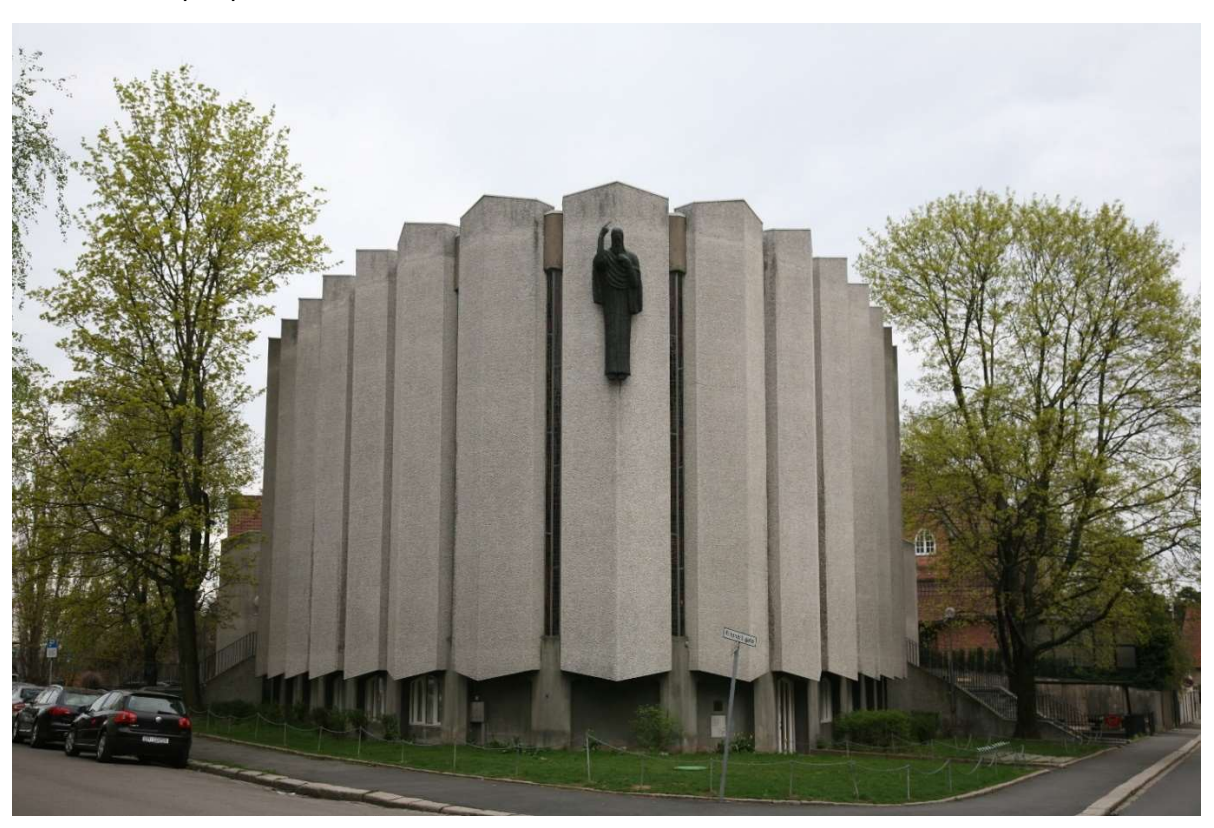
Afternoon – We will visit Frogner Park, which is the site of the Vigeland Sculpture Park.

11AM – We will attend worship at the American Lutheran Congregation, followed by a fellowship time with the people of the church.