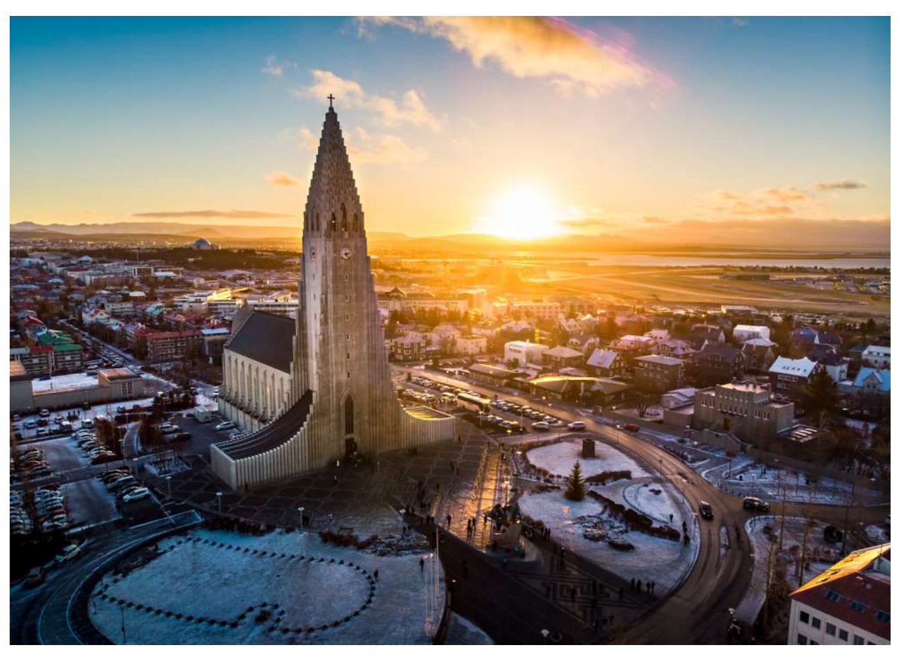
Sunday, August 31 Hopefully we will have time to attend worship at the Reykjavik Cathedral – a towering church that dominates the Reykjavik skyline, before we go to the airport for our trip home.