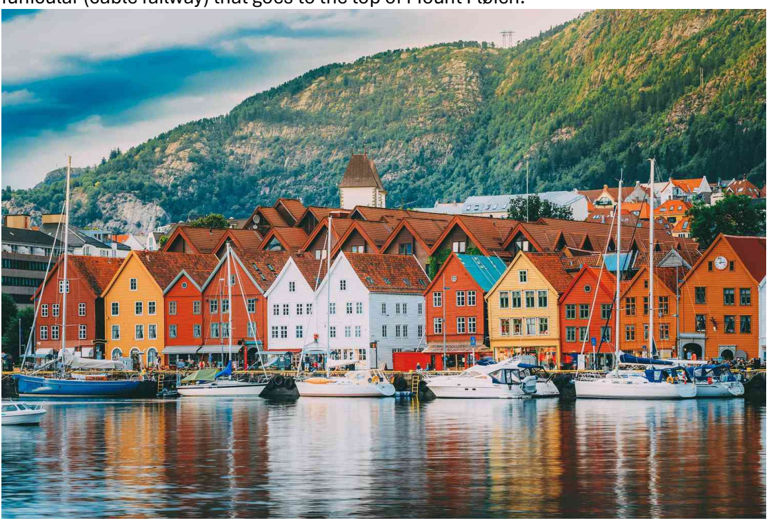
Friday, August 22 We will take a tour of the city of Bergen with a local guide. The tour will end at Fløibanen, the funicular (cable railway) that goes to the top of Mount Fløien.